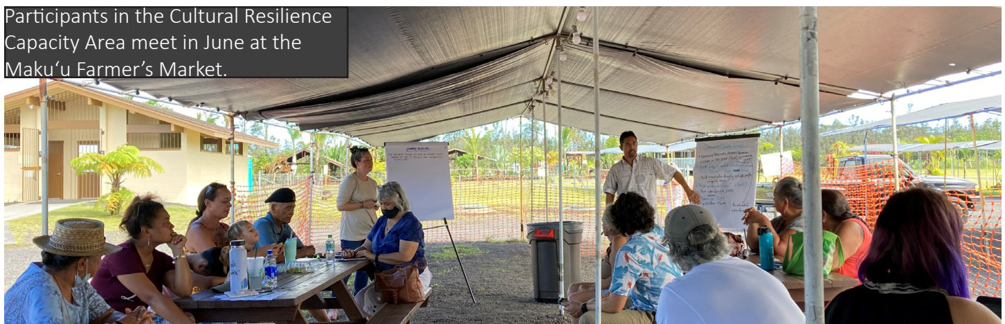
Participants in the Cultural Resilience Capacity Area meet in June at the Maku‘u Farmer’s Market.