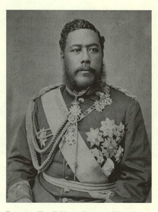
FIGURE 3. King Kalākaua.

in only nine months. This particular mele states that Kalākaua was crowned king, a chief from "Ka lā puka i Ha'eha'e," a king who was not only from where the sun rises in the Hikina, at Ha'eha'e, but a king who was at the launch of his rule. The mele goes on to reveal names of his famous ancestors that precede him genealogically. These include Keaweaheulu, Ululani, 'Aikanaka, Punaohe, and Keohohiwa, all of whom give him the genealogical right to rule as a person of royal lineage. The concluding line says, "Stand in glory, in this chiefly position."